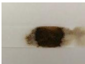
250 ppm sulfide

Test Method #2: Place a drop of the solution being tested on the paper