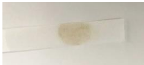
5 ppm sulfide

Test Method #3 (Air Sampling): Moisten the test paper with water and expose it to the atmosphere suspected of containing hydrogen sulfide.