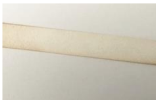
Dry test paper

Test Method #3 (Air Sampling): Moisten the test paper with water and expose it to the atmosphere suspected of containing hydrogen sulfide.