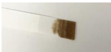
250 ppm sulfide

Test Method #1: Dip the test paper into a water sample containing sulfide