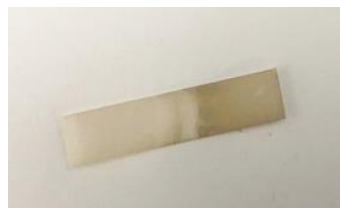
Moistened test paper

Note: When air sampling – the level of darkening will depend on the rate of air flow, the length of time the paper is exposed, and the level of hydrogen sulfide present. Care should be taken to understand the implications of these and other variables in determining the ppm level of the sulfide present.